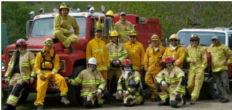
Telegraph Ridge Volunteer Fire Department.

There is one local-government Type-3 Engine Strike Team composed of several local fire organizations in the county. CAL FIRE hires this Strike Team to supplement their resources during wildfire events both inside and outside the county. Local fire department equipment is also rented by the state and operated by CAL FIRE personnel when needed. Local fire service financially benefits from this arrangement, both to the participating fire department and individual firefighters, and by circulating the funds into the local economy. Indirect benefits to local firefighters, including volunteers, include gaining valuable wildfire management experience, which also benefits local communities by developing more confident, capable local firefighters. Firefighters learn about wildfire management strategies, emergency radio communications, working together, training needs, and the physical demands and expectations required by CAL FIRE and the USFS. This experience increases the ability of local firefighters to quickly and efficiently organize resources, should a large wildfire event happen here.