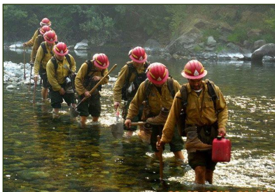
SRNF fire crew.

Staffing levels are based on level of fire danger, with the greatest staffing May through October and reduced staffing the rest of the year. During periods of increased fire danger, SRNF staffs twelve