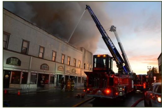
Star Hotel fire, Fortuna.

The Public Safety and Essential Services half-cent sales tax, passed by Humboldt County voters in 2014 through Measure Z, provided critical fire and rescue support funding over the last three years, facilitating a spirit of cooperation between local fire organizations. Over $5.5 million in Measure Z funding has been awarded to purchase firefighting equipment, pay dispatch fees, and continue a multiyear sustainable fire-services planning effort. Measure Z purchases and activities have benefitted volunteer, and especially rural fire organizations, to increase the safety and capability of firefighters within the county.