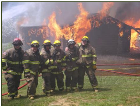
Westhaven Volunteer Fire Department.

Equipment purchases are bringing local fire service up to nationally recognized minimum-level safety equipment and emergency-response apparatus standards. Updated equipment helps responders be better prepared, and decreases the risk of injury while increasing the ability to protect the public. Equipment purchases include fire engines, self-contained breathing apparatus (SCBA), wildland- and structural-fire personal protective equipment (PPE), and fire hose. Additionally, permitting and purchasing structures to protect fire equipment that was historically stored outdoors or in unsecured locations has been funded. These improvements will have a direct impact on fire departments' ability to improve their Insurance Services Office (ISO) Fire-Suppression Rating Schedules, which can in turn, lower homeowner fire insurance rates. The Public Safety and Essential Services sales tax was renewed by voters in 2018 through Measure O and will continue to be an important source of funding, depended upon by local fire and rescue service providers.