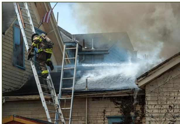
Humboldt Bay Fire Department.