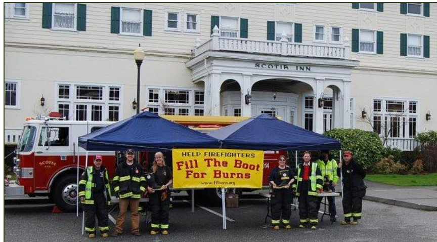
Scotia Volunteer Fire Department.

More detailed information about each local fire organization, including their recent accomplishments, can be found in each relevant Planning Unit Action Plan in Part 4 of this CWPP, and in the current version of the Humboldt County Fire Chiefs' Association Annual Report, available at https://humboldt.gov/Archive.aspx?AMID=75 .