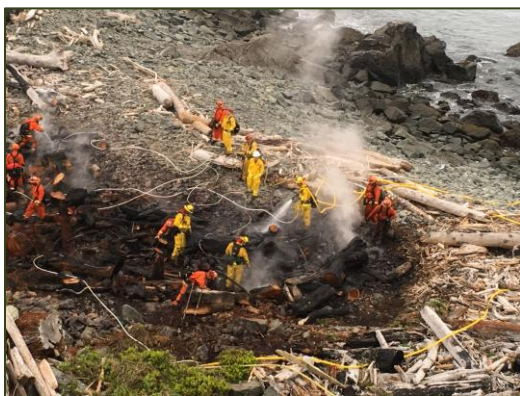
CAL Fire extinguishing a beach fire near Trinidad.

CAL FIRE operates two local Conservation Camps jointly with the Department of Corrections and Rehabilitation, Eel River Camp in Redway and High Rock Camp in Weott. Inmates serve out their sentences performing firefighting and conservation-related tasks. The crews are an all-risk department resource used both locally and statewide. During non-emergency response times, these crews work on fuel-reduction and other projects as requested by public agencies. They are trained in emergency response for fires and floods and utilized for various emergencies as needed.