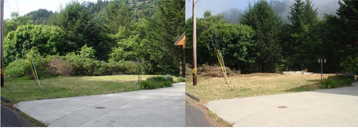
Photo of brush on vacant property within 200 feet of one of the homes on Beach Road and after photo showing the expansion of defensible space.