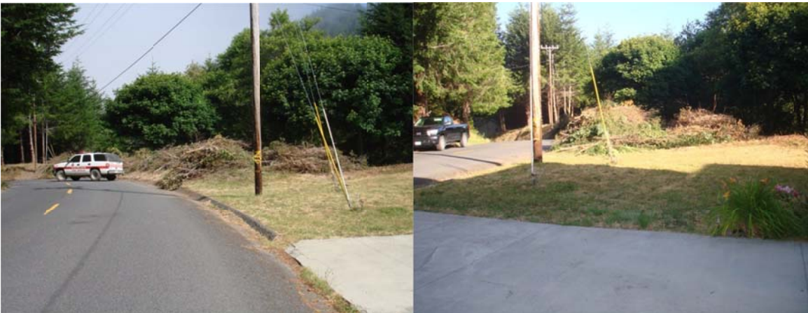
Cut debris piled up alongside Beach Road ready to be chipped.