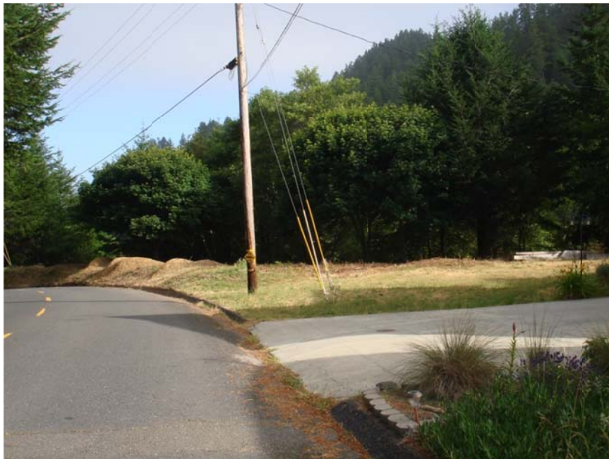
Debris chipped ready to be spread by CAL Fire crews.