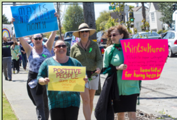
Events throughout the month raised the profile of mental health in the community during May is Mental Health Matters Month. Left, more than 100 mental health advocates marched from the Hope Center to the courthouse for the May 9 Mental Health Walk.