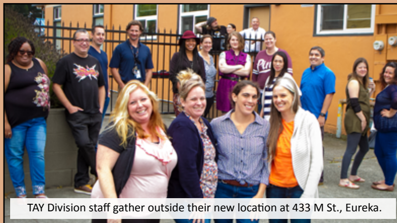
TAY Division staff gather outside their new location at 433 M St., Eureka.

The TAY Division is now located at 433 M St, Eureka (between Fourth and Fifth streets). ◀