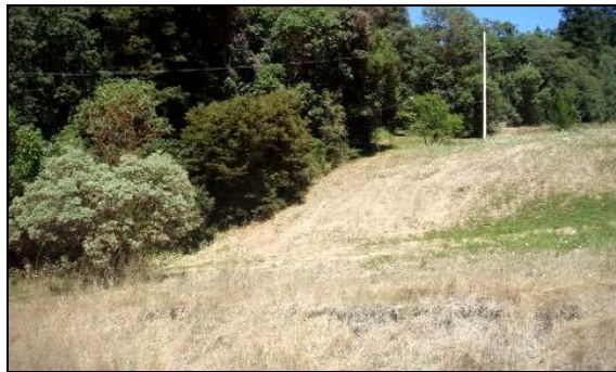
Figure 14: Landowners in the Orleans and Some Bar communities are being reimbursed through the FLASH program for mowing around their properties. Removing fine fuels from around a house reduces risk of a fire escape and reduces the intensity of incoming fire from a neighboring property.