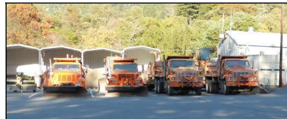
Figure 2: Orleans Cal Trans Yard