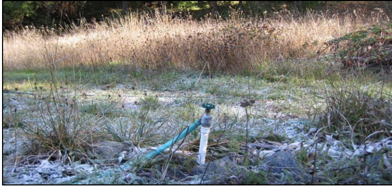
Figure 9: Many properties have inadequate water resources, or have water sources which are not compatible with firefighting equipment. Water draw sites and water tanks need to be marked under the blue dot system.