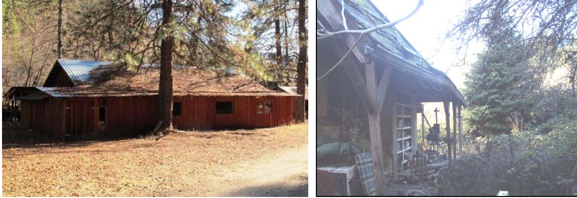
Figure 11: Fuel which accumulates on roofs and in gutters is a prime ignition point for embers, and a common cause of structure loss during a fire. The roof and cavities or openings underneath a house are the two most critical points to focus on when preparing a house for fire safety. People in the community of Orleans enjoy having trees around their houses, which is fine, but with the beauty comes more responsibility to keep roofs and gutters clean.

The following homeowner recommendations center on mitigating the hazards observed above by maintaining defensible space and using Firewise construction practices.