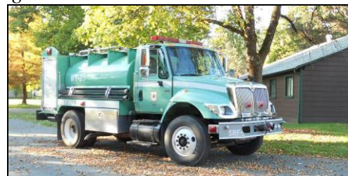
Figure 4: USFS Orleans Ranger Station