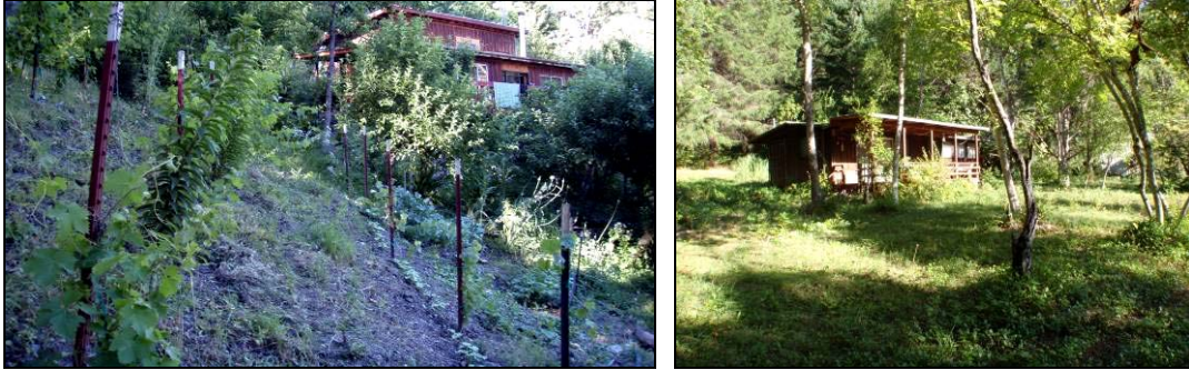
Figure 12: Many residents in Orleans maintain defensible space around their properties. There are many examples of homes which are fire safe and adapted to their fire environment.