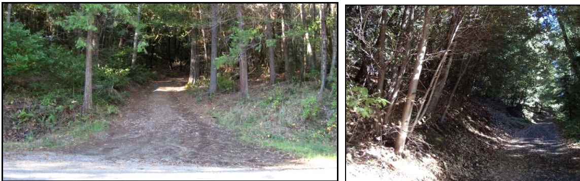
Figure 8: Many road intersections and properties in the community of Orleans are poorly signed or do not have signage at all. This is especially true for the more remote residences away from town. Ingress and egress routes are often grown over with vegetation and many properties have inadequate vehicle turn around spaces.

The vegetation in the middle Klamath grows very quickly because of abundant moisture, and many plants are adapted to burn with high intensity to clear the environment around them of competition. Another factor that makes maintaining defensible space in this fire environment difficult is that most broad leaf plants sprout from stored energy in their roots, and many brush species have hard coated seeds that persist in the soil until stimulated to sprout by fire or other disturbance. The key to creating a defensible space that will work to stop or moderate fire spread is maintenance; no single action will create a permanent defensible space.