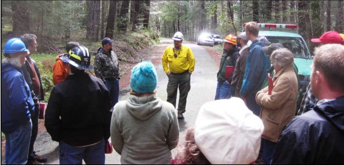
Figure 16: 2011 Klamath Fire Ecology Symposium, organized by the Mid Klamath Watershed Council. Several days of lectures and workshops, open to the public, with the goal of sharing information on fire.