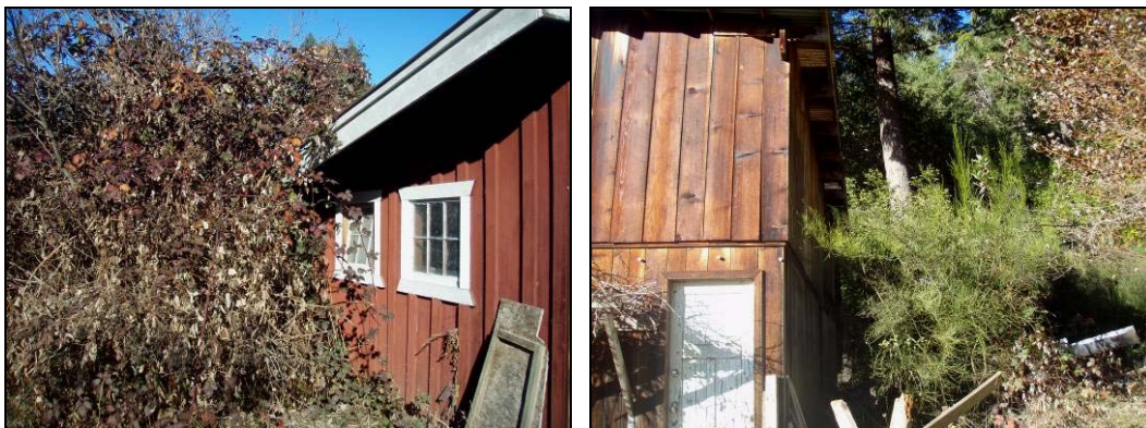
Figure 10: These photographs illustrate a common situation in an area with high rainfall and a long growing season. Vegetation and dead plant matter quickly accumulate next to structures with wooden siding and create a fire hazard. Most houses in the community of Orleans have unscreened eaves, wooden siding, and many have single pane windows.

This problem is often associated with tree branches overhanging the home and flammable vegetation growing right up against the structure. Another hazardous situation observed was a great number of homes with flammable roofing and siding and without many of the construction techniques that would greatly reduce the risk of ignition during a nearby wildfire event.