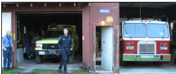
Figure 1: Orleans Volunteer Fire Department