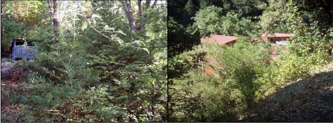
Figure 7: Examples of fuels conditions around properties in Orleans and Somes Bar

The vegetation in the middle Klamath grows very quickly because of abundant moisture, and many plants are adapted to burn with high intensity to clear the environment around them of competition. Another factor that makes maintaining defensible space in this fire environment difficult is that most broad leaf plants sprout from stored energy in their roots, and many brush species have hard coated seeds that persist in the soil until stimulated to sprout by fire or other disturbance. The key to creating a defensible space that will work to stop or moderate fire spread is maintenance; no single action will create a permanent defensible space.