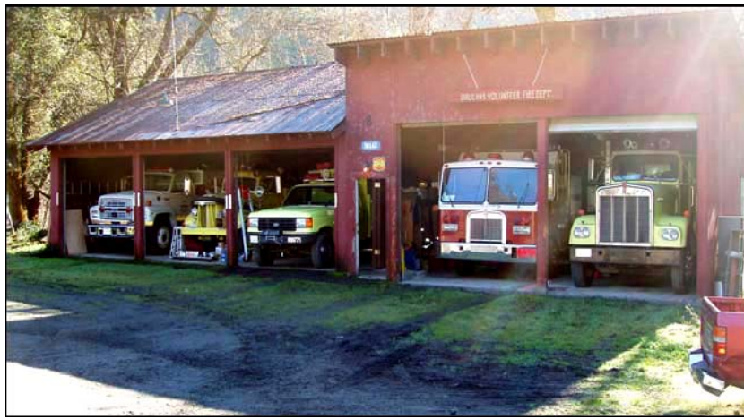
Figure 6: Orleans Volunteer Fire Department engine bay. The Department maintains a 1985 Kenworth Type-1 Structure Engine, a 1985 Ford F800 Type-3 Wildland Engine, a 1973 Kenworth 3,500 gallon water tender, and a 1988 Ford F250 walk-in rescue rig.

Vegetation on private lands varies widely. Many high river bars along the Klamath that were hydraulically mined in the 1890-1910 period now support local farms and private residences. Other private parcels may be largely forested or may contain residences, gardens, or pastures in small to medium openings in the forest.