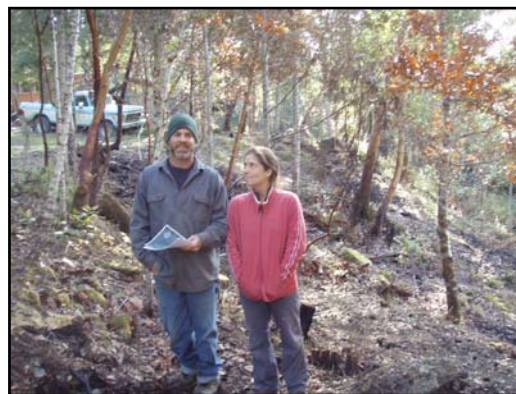
Figure 15: Landowners are reducing surface and ladder fuels around their properties through FLASH. Clearing fuels from access routes and from around houses is the most important action landowners can take to protect their properties from fire damage.