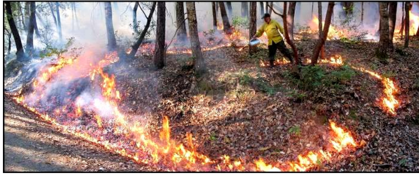
Figure 13: A landowner in Orleans contracts a local burn boss through the FLASH program. Controlled burns reduce surface fuels and kill sprouting vegetation, creating an excellent barrier to intense fire around residences.

The following photographs were taken in Orleans and Some Bar and are examples of good Firewise practices: