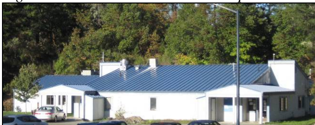
Figure 3: Karuk DNR and Clinic