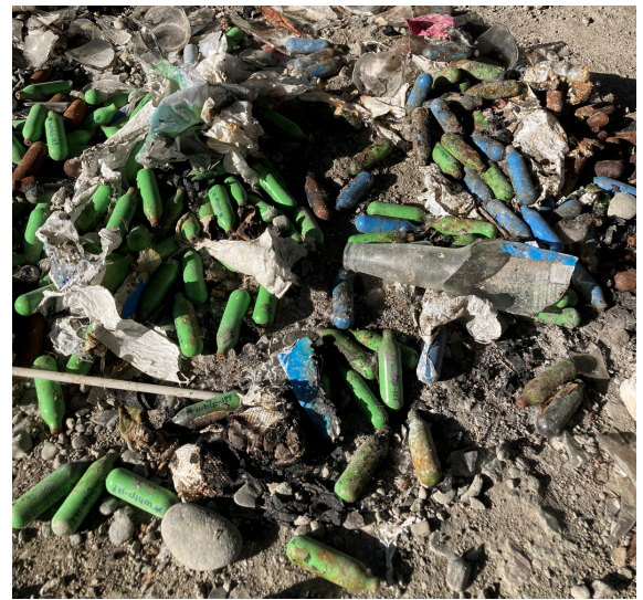
Nitrous oxide “whippet” cannister litter found at the mouth of the Van Duzen River near Alton.

In January 2024, the Board of Supervisors directed the DHHS-Public Health Branch to address retail sales of recreational nitrous oxide through education and policy approaches. In June 2024, Public Health’s Substance Use Prevention program was awarded funding from the Department of Health Care Services Substance Use Block Grant Primary Prevention Services grant to work on recreational nitrous oxide education and prevention activities throughout Humboldt County from 2024 through 2028.