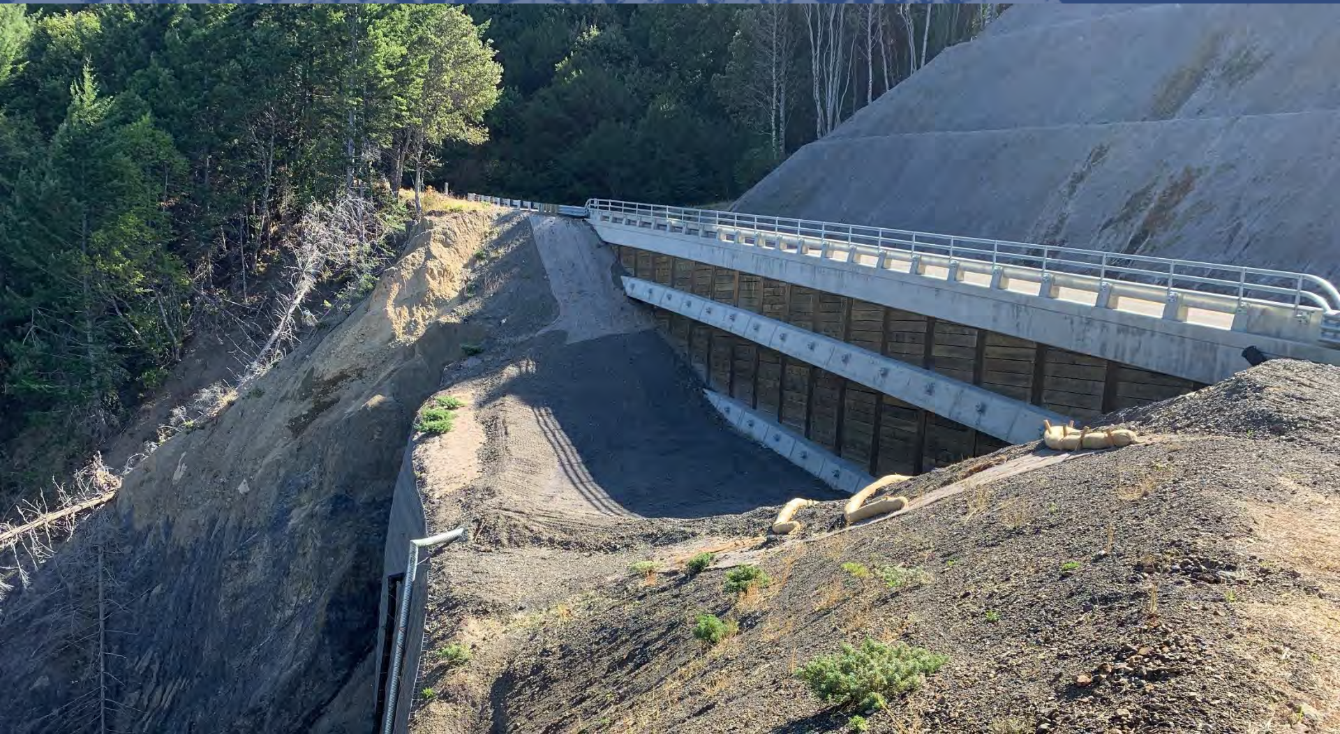
Shelter Cove Rd After