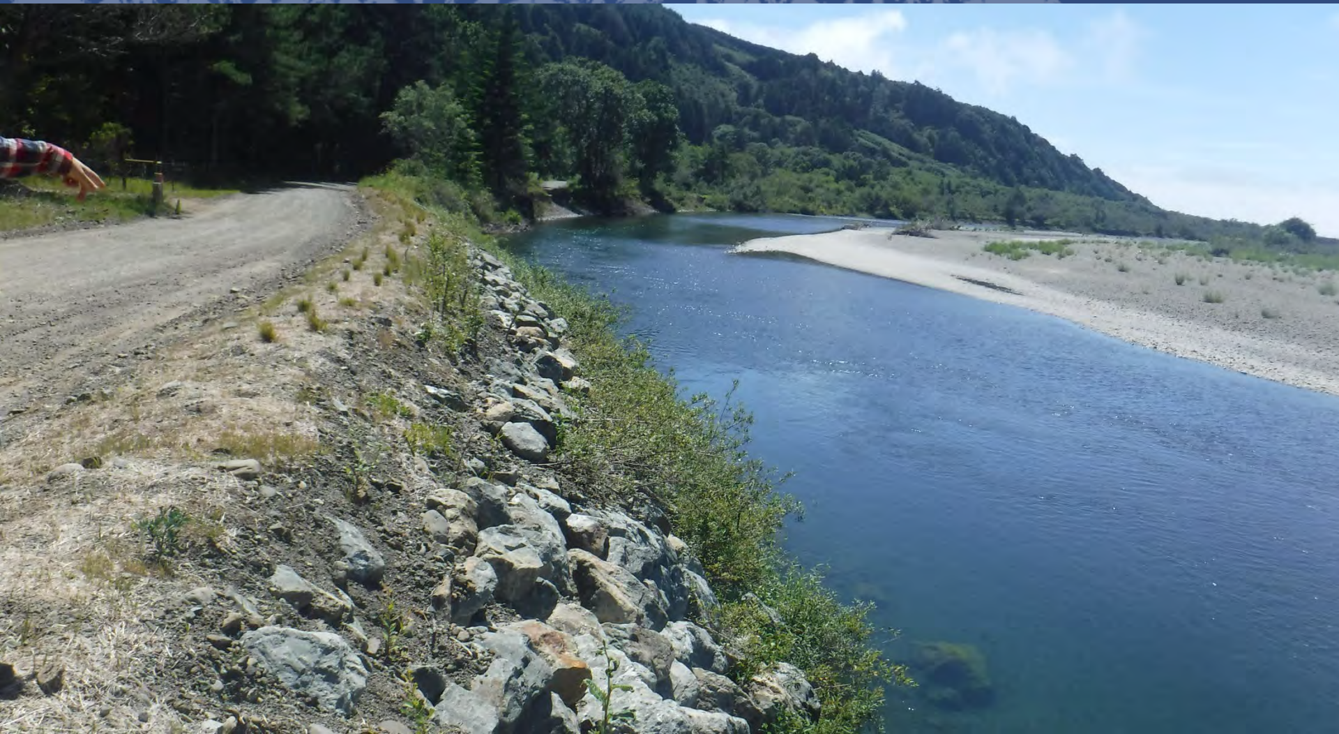
Lighthouse Road After