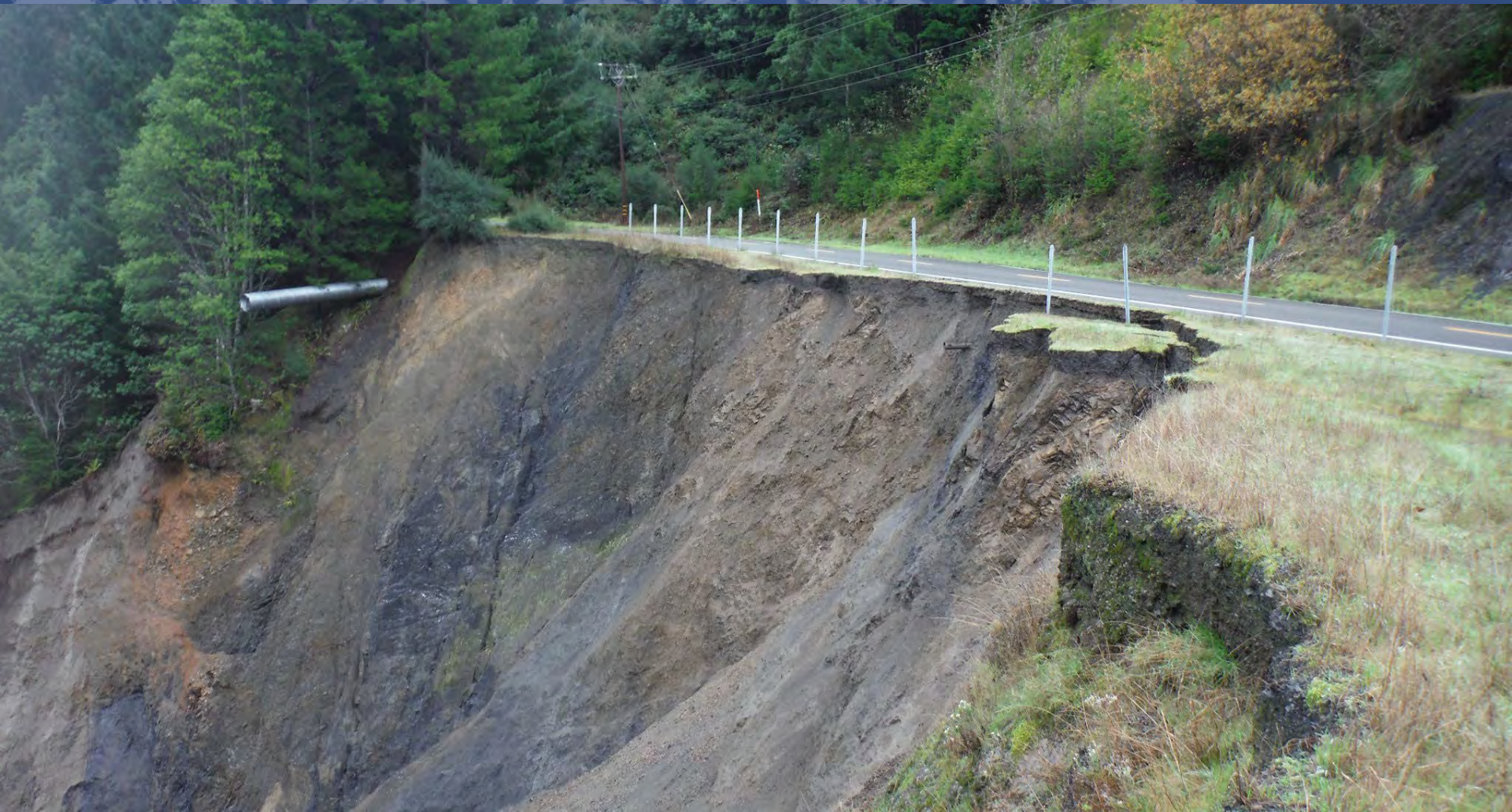
Shelter Cove Rd (2017) Before