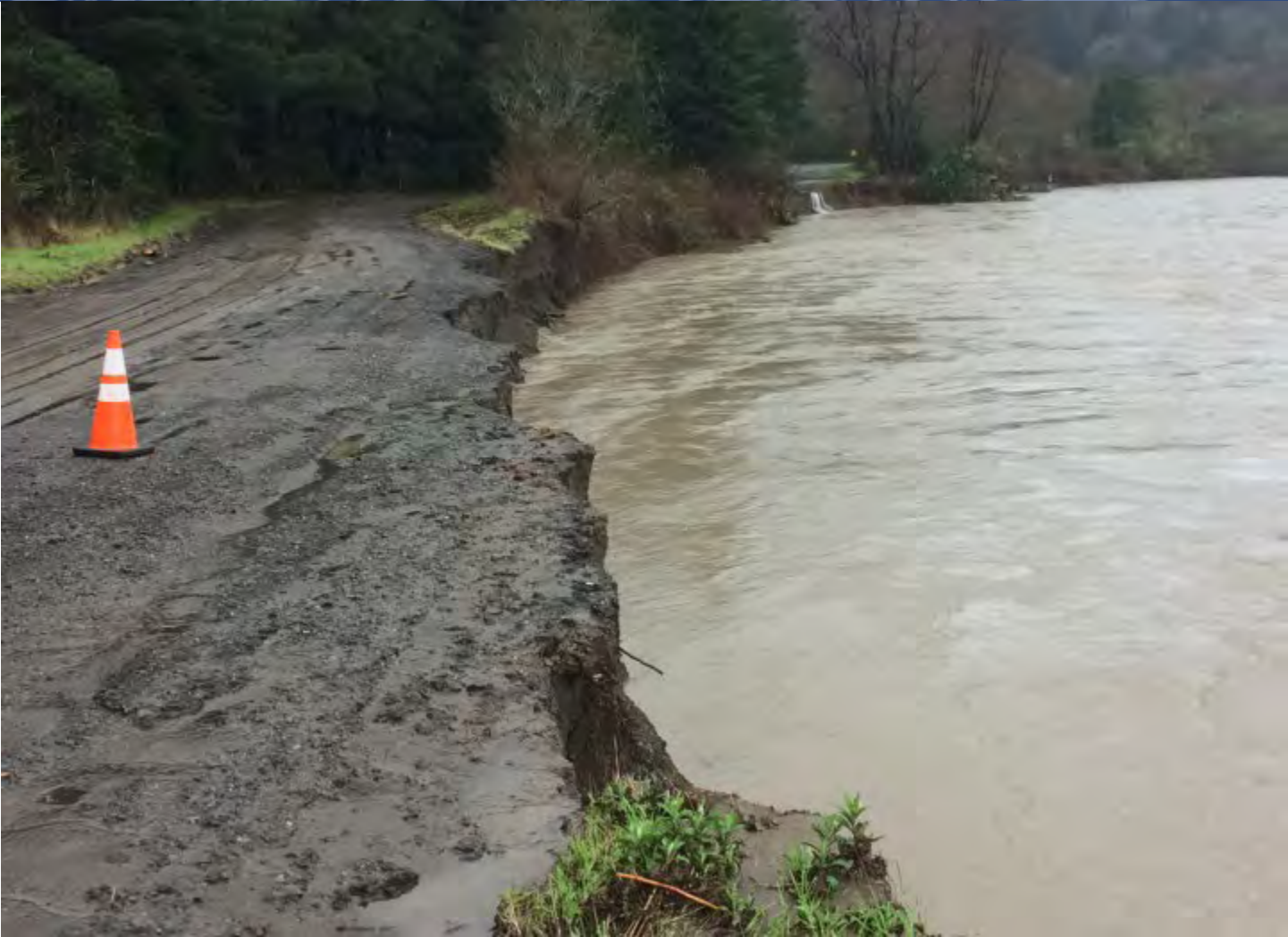
Lighthouse Road (2019) Before