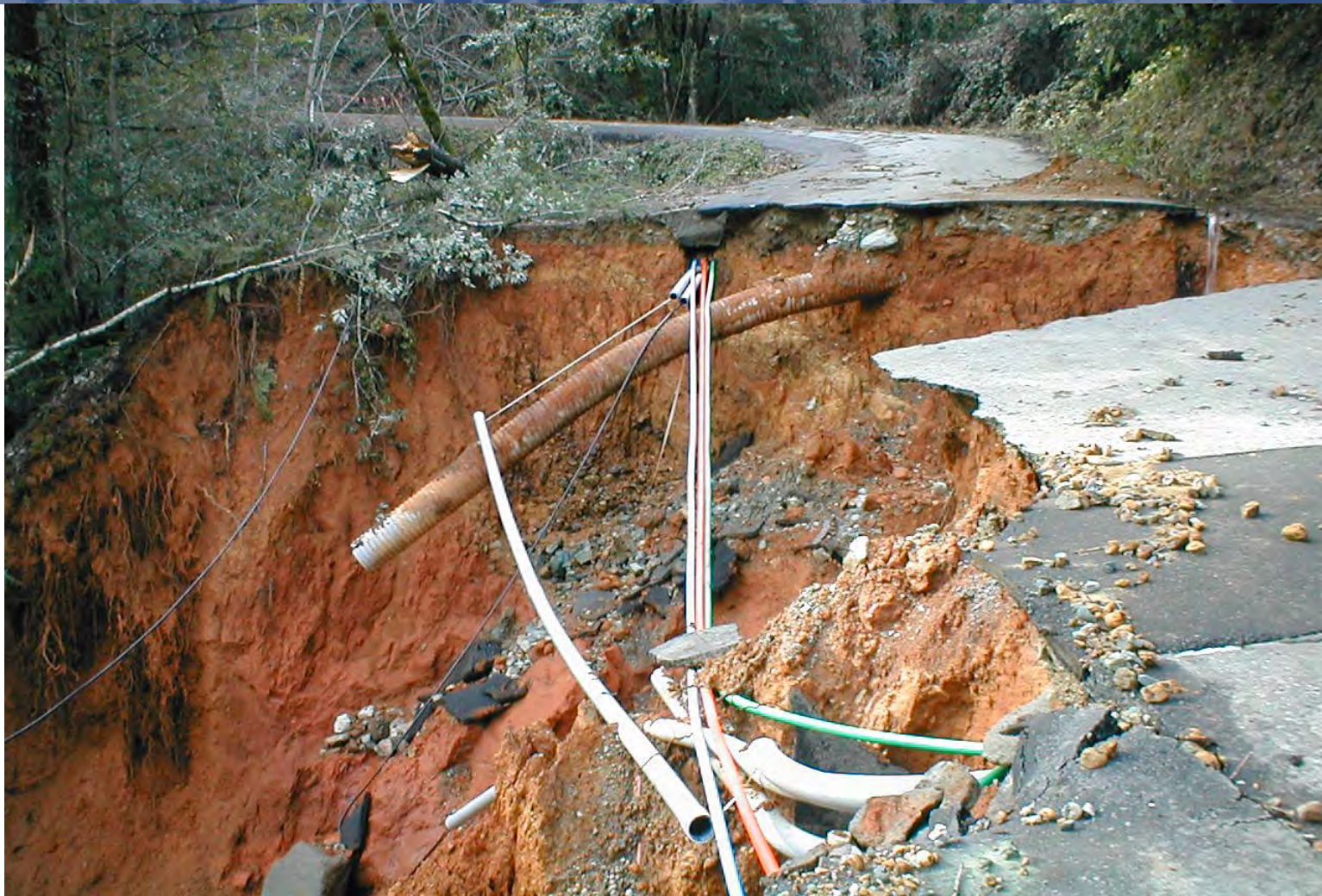
Ishi Pishi Rd Before