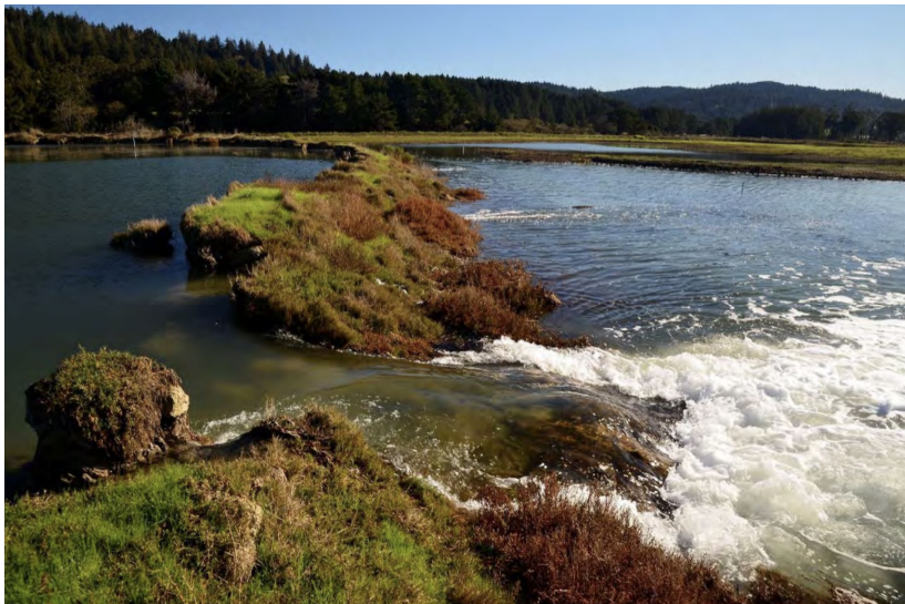
Dike overtopped during a King Tide inundating lands on South Bay 4

When breached, the 25.7 miles of highly vulnerable shoreline structures will expand the tidal inundation footprint of Humboldt Bay by 52% or nearly 9,000 acres. Breaching of dikes has already begun partially due to lack of, or deferred, maintenance. King Tides have also been a contributor. In addition to the dikes, there are 62 tide gates whose effectiveness can be compromised by rising sea levels. Areas impacted the most will include the Eureka Slough (7.13 miles), South Bay (5.1 miles), Mad River Slough (4.4 miles) and Arcata Bay and its railroad shoreline (4.0 miles).