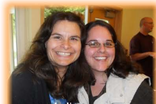
We not only discovered old friends, but that our departments do business a lot alike, too.