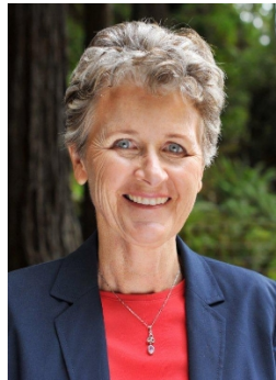
FENNEL District 2